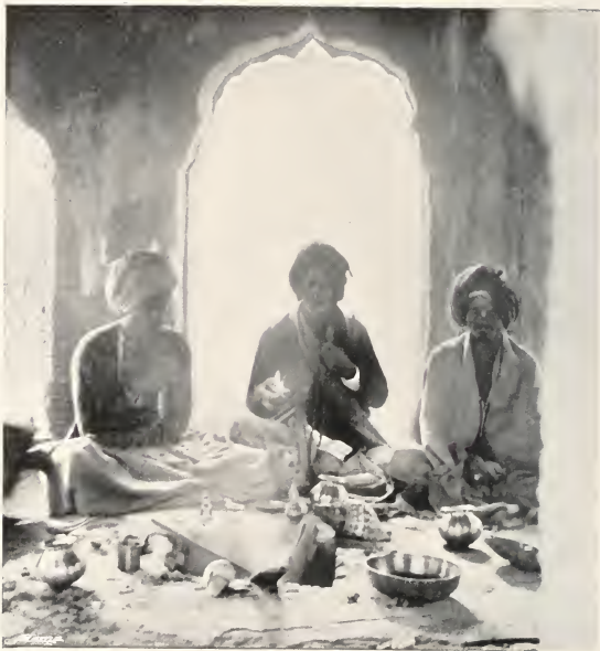
PRIESTS OF THE SACRED FIRE.